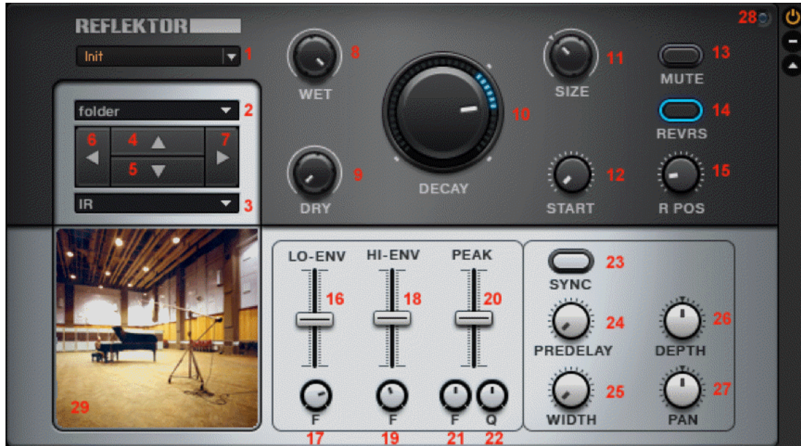
Fig. 2.1 REFLEKTOR loaded in GUITAR RIG with numbered controls.

Once installed, REFLEKTOR is found under the Components tab in GUITAR RIG. Double click or drag and drop the component to make it appear in the Rack.